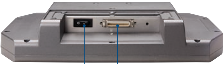
Power button LVDS connector