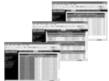
The web-based user interface allows users to set the alarm criteria and select alarm outputs for each sensor input independently.