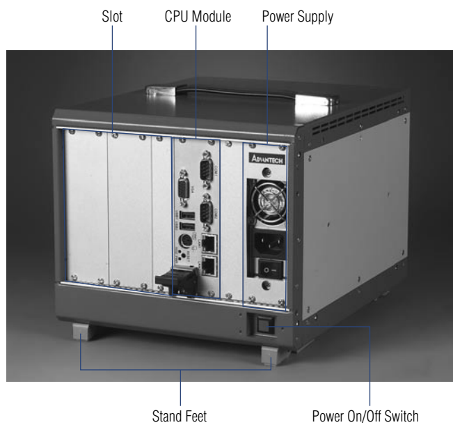
Rear View of MIC-3002AD/6