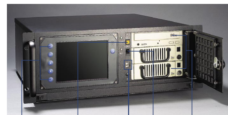
OSD function keys Reset button Two USB ports Power switch Three 5.25" drive bays