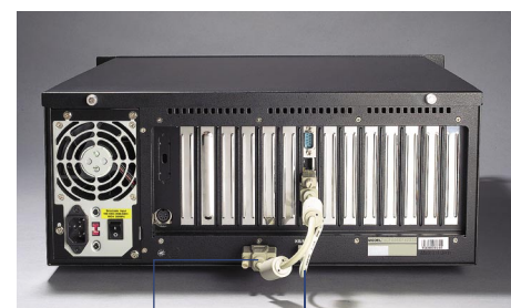
VGA convert cable Keyboard convert cable