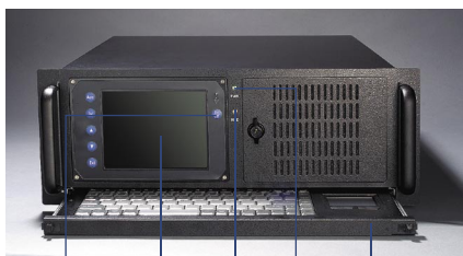
OSD power LCD Display HDD LED Power LED Slim type keyboard and touch pad

A front viewable system status LED monitors the power, HDD and LCD activity. Advanced user-friendly OSC (On Screen Control) function keys support the LCD display. Behind the door are accessible system reset, power switch and USB which supports a wide range of peripheral devices for data transfer. ACP-4060's flexible mechanical design supports single PS/2 or redundant power supply through a power bracket replacement.