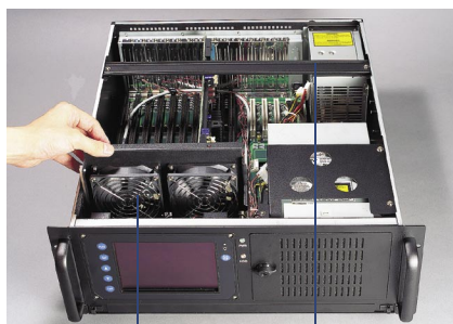
Two replaceable 84-CFM cooling fans Hold-down clamp