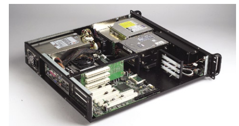
The inside view of ACP-2320MB