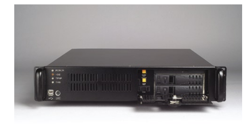
The front view of ACP-2320MB