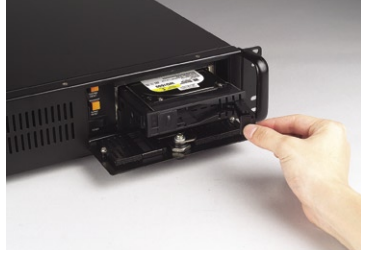
Dual easy-to-maintain SATA HDD trays